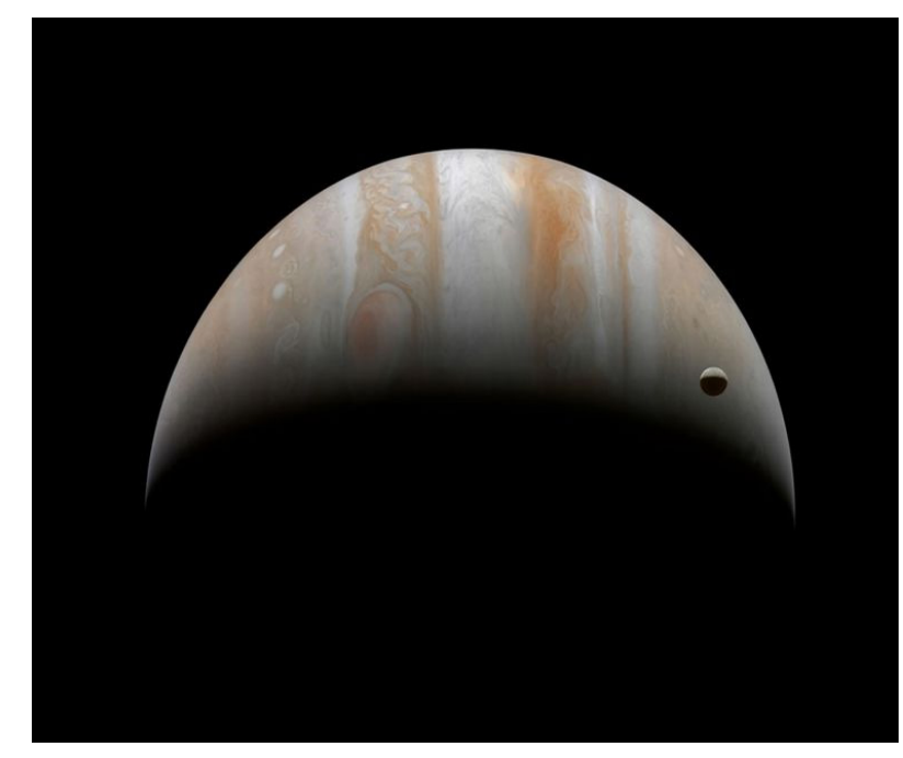
For over 9,000 years the 5th day of the week has been named for the planet Jupiter. Thursday is from 'Thor's Day' as Thor was the Norse Jupiter. The moon Ganymede on the right is larger than the planet Mercury.